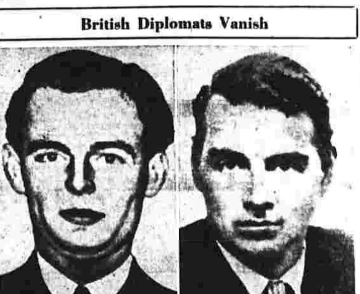
Donald Duart MacLean (left), 38, and Guy Francis De Morny (right), 40, British diplomats, are being hunted all over Europe by British secret agents and police.

Rome Message Shifts Search For Diplomats French Police, After Combing Paris, Think Two Missing British Aides are in Italy